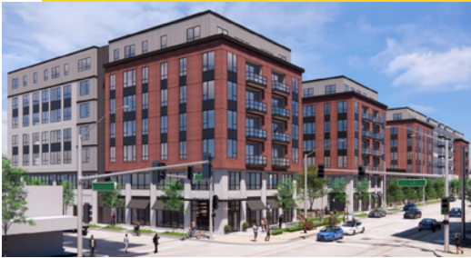
RENDERING OF SUBTEXT MIXED-USE DEVELOPMENT